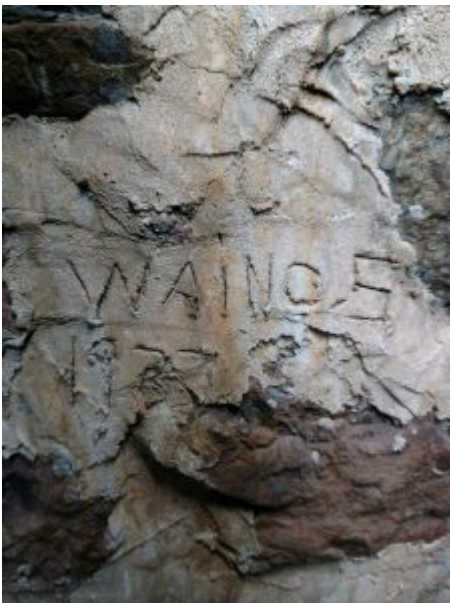
Cabin 10 – On Chimney

In each of the 2 roofing phases, the roofers found interesting artifacts where the roofers in the 1930s left behind their names – carved their names into history at the resort.