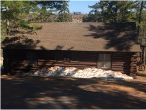
Cabin 25 – New roof