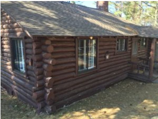
Cabin 10 – New roof in 2019

In the Keweenaw, roofs are critical for the sustainability of a structure. Neglected roofs in the Keweenaw will result in both damaged roofs, as well as damaged integrity to the foundation of the structure. In our case, if a roof had fallen in, the logs would be damaged – either by rot or the weight of the fallen roof.