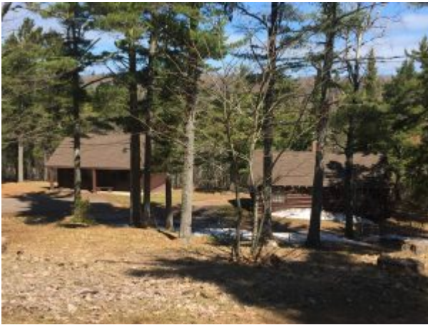
Cabins 22/23 – New roofs

To show how much snow the Keweenaw gets, and how important strong roofs are, we can point to the 2019 winter season. During the 2019 winter season, we had close to 4 feet of snow on the forest-side cabins before we started to remove the snow. 4 feet of fresh snow equates to around 20 pounds per square foot. We