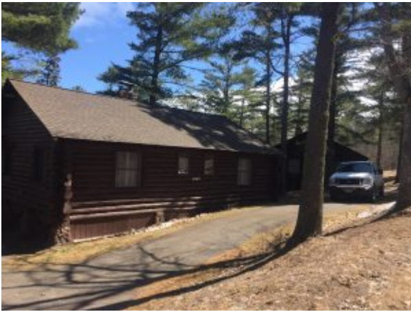
Cabin 24 – New roof