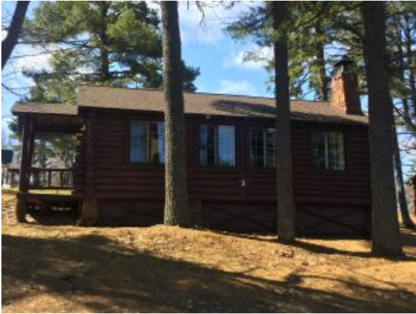
Cabin 3 – New roof in 2019