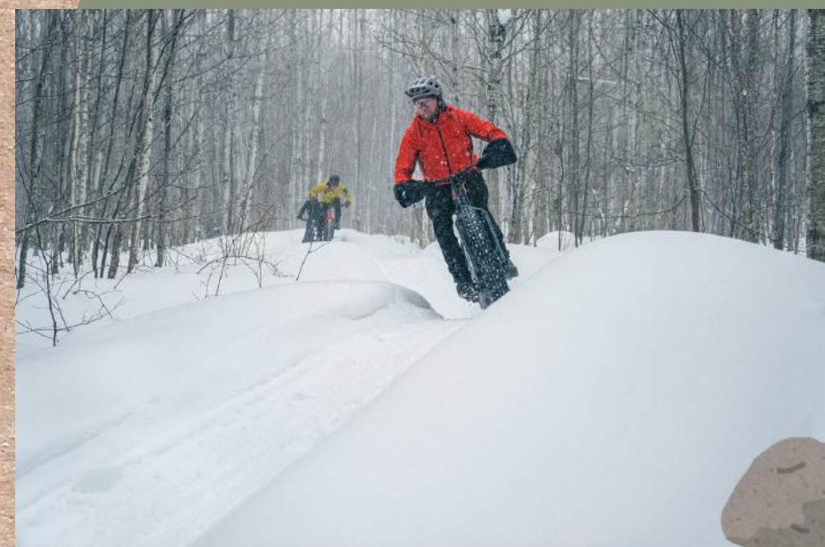
CALUMET TOWNSHIP FAT-TIRE TRAILS (2022)