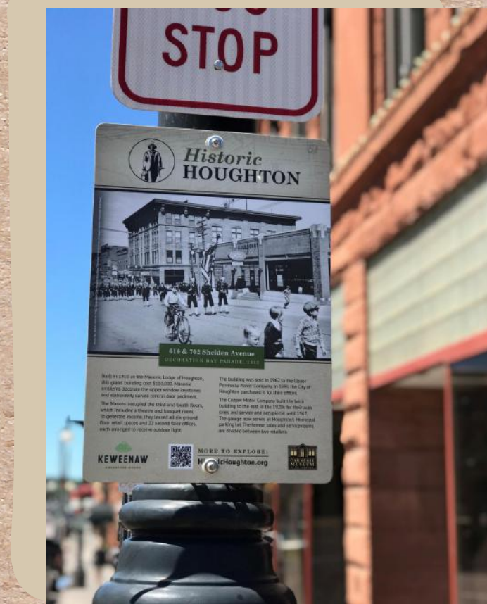
VIRTUAL HISTORIC DOWNTOWN HOUGHTON WALKING TOUR SIGNAGE (2022)