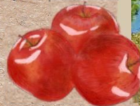
ORCHARD HIKE & BIKE TRAIL (2023)