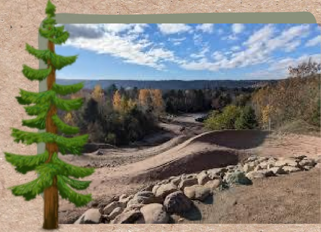
MAASTO HIITHO SKILLS PARK (2025)