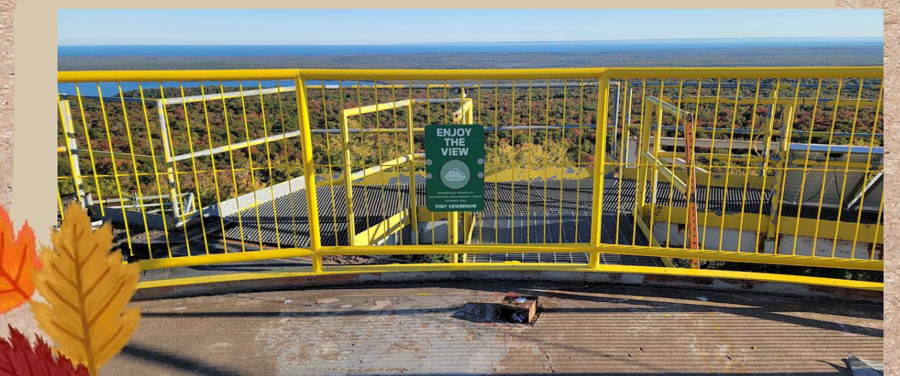
CALUMET AIR FORCE STATION HERITAGE MUSEUM (2024)