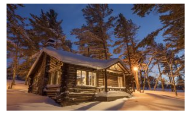
Cabin 11 - Feb 2019

The next step with the winter test is to increase the load on the infrastructure. As such, we are opening up the cabins to more guests to stay this winter. This increase in usage of the cabins during the winter time will provide us more data on how well the resort can hold up during the snowy season.