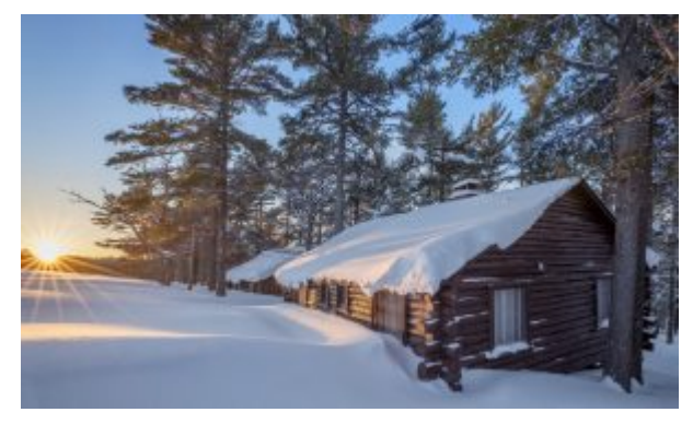
Cabin 4 - Feb 2019

positive so far in this journey — step-by-step we are determining what will work in the winter time at the Lodge.