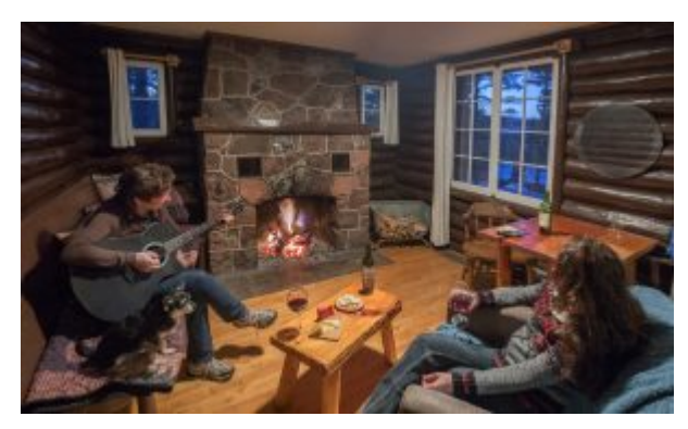
Cabin 3 - March 2019