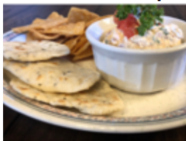
Appetizers - or -