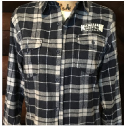
KML Embroidered Burnside Flannel Shirt-Stone