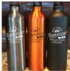
Water Bottle 24oz