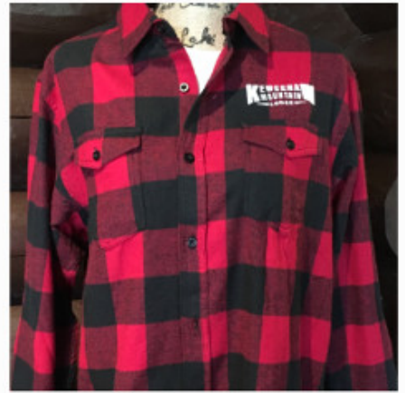
KML Embroidered Burnside Flannel Shirt-Red