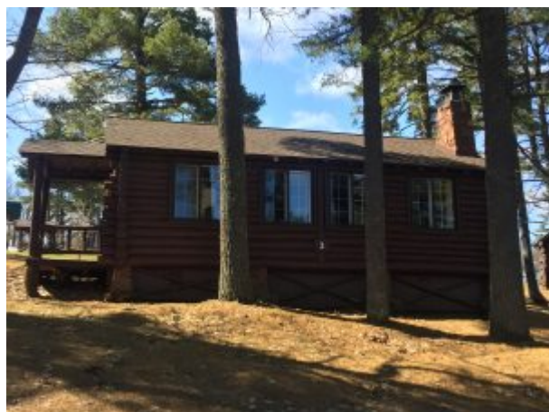
Cabin 3 – New roof in 2019

structures we have on property. The shingles were deteriorating, cabins were experiencing leaks, and moss was growing on the roofs.