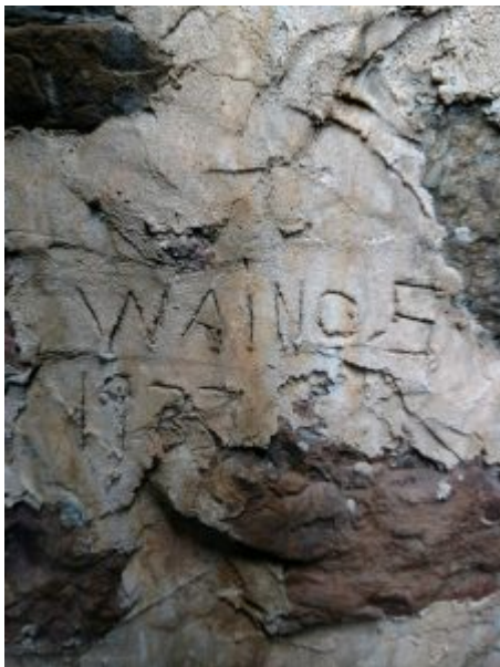
Cabin 10 – On Chimney

In each of the 2 roofing phases, the roofers found interesting artifacts where the roofers in the 1930s left behind their names – carved their names into history at the resort.