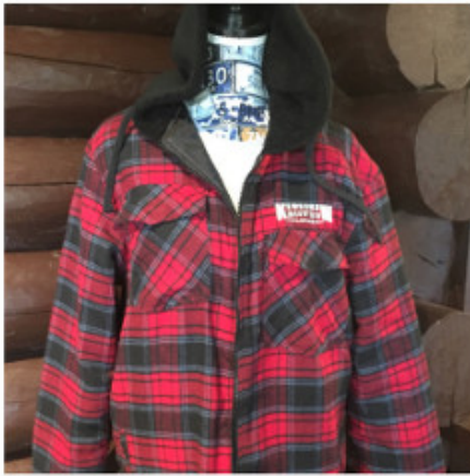
KML Embroidered Burnside Flannel Jacket-Red