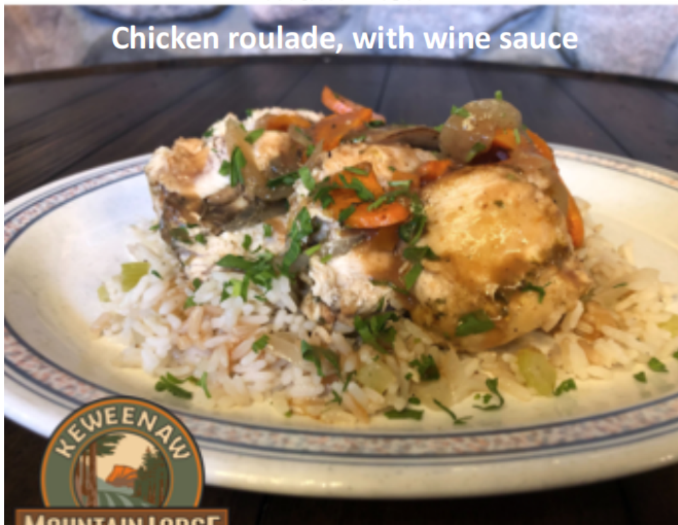
Chicken roulade, with wine sauce