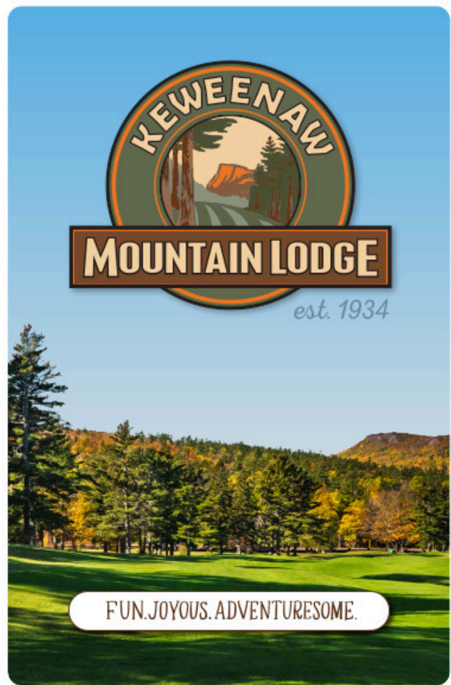
The new scorecard design – front -back