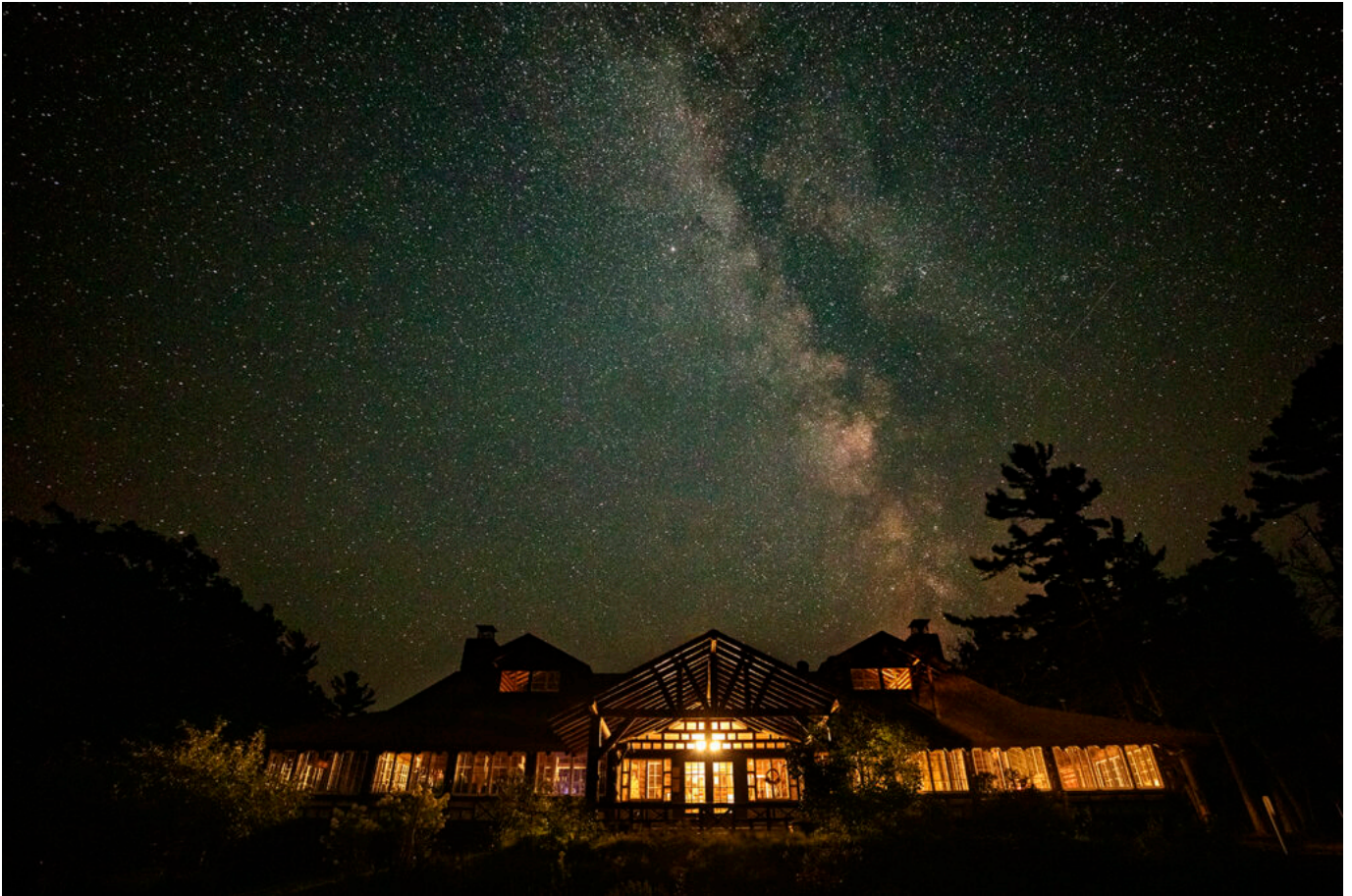
Image information: Camera: Canon 5D Mark 4 – Lens: Canon 16-35 L III Settings: ISO 3200 – 15 seconds f2.8 – lens set to infinity

As you can see the Canon camera had a superior image quality. Since this is just my first test with the iPhone on a tripod I still need to do some more experimenting. Afterwards I did some web searching and found this article stating that “Night Mode isn’t available when the 48-megapixel setting is on”. This made me rethink what I did and what I need to do next time.