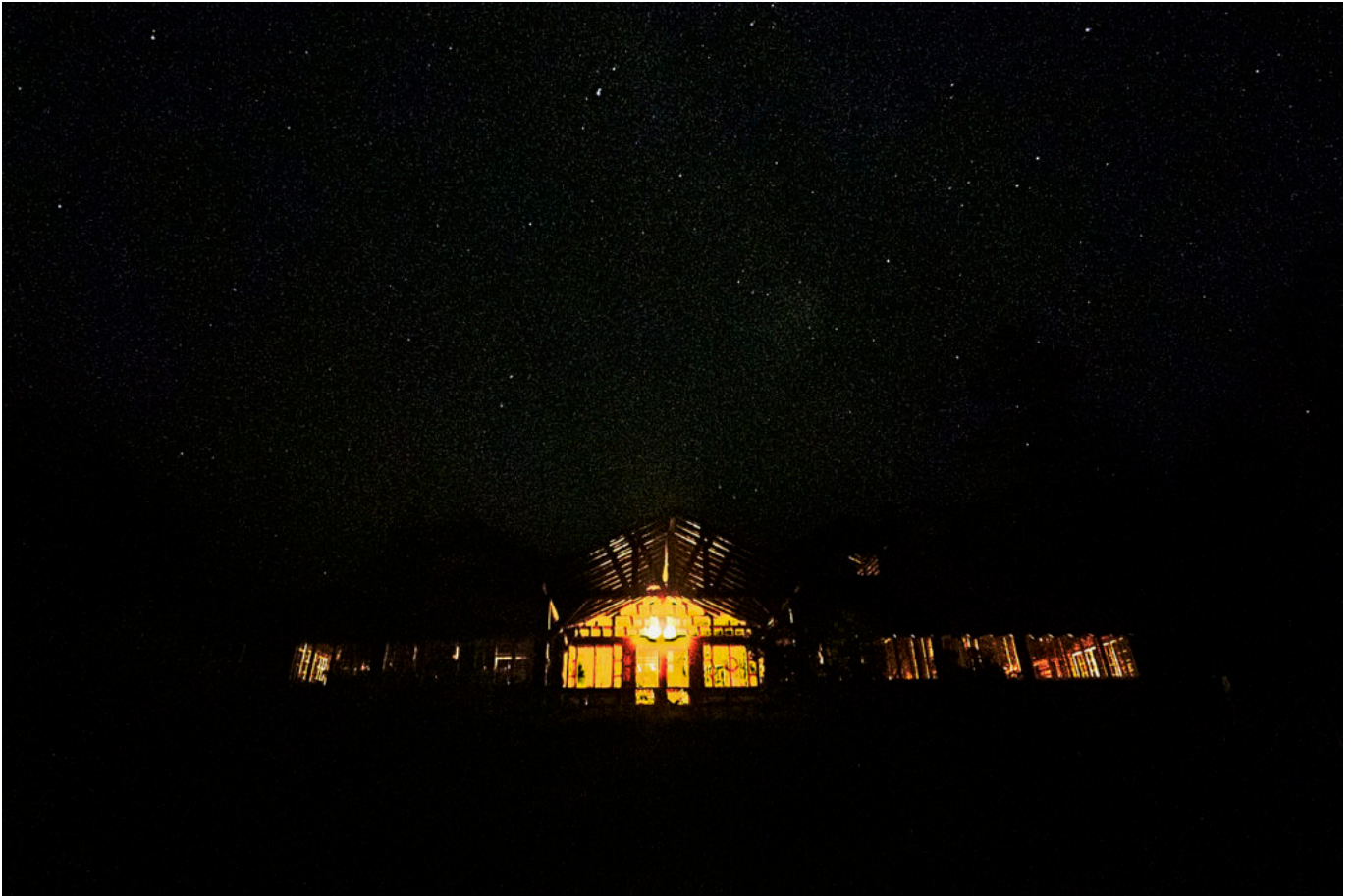
Image information: iPhone Pro Max 13 – Settings: ISO 3200 – 30 seconds f1.8 – lens set to 13mm