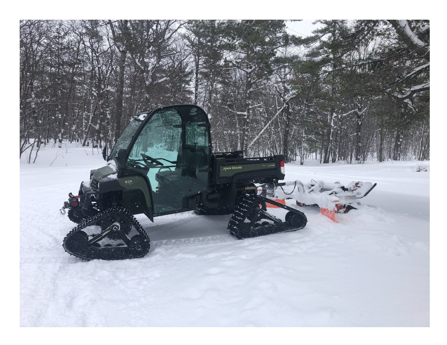
[ <u>Keweenaw County Snowfall</u> ]