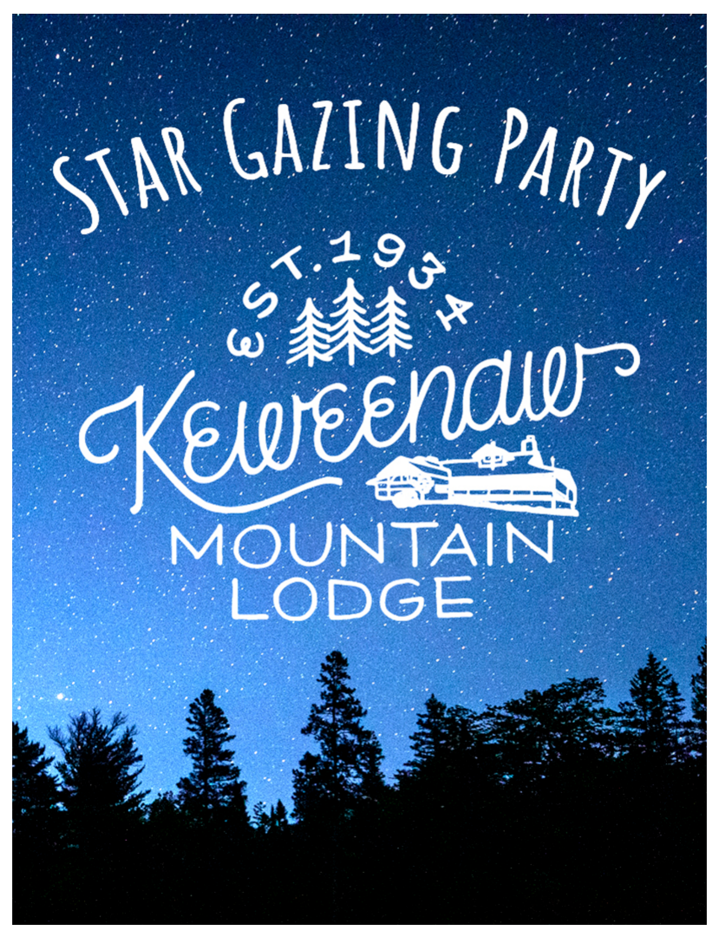
The West Overlook is a popular spot for sunsets and stargazing